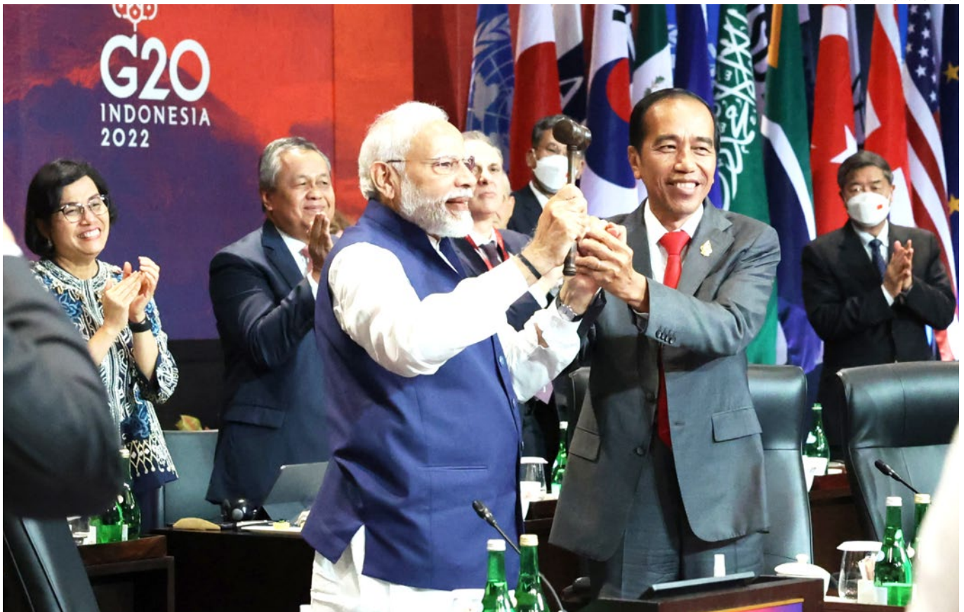
Indonesia's President Joko Widodo and India's Prime Minister Narendra Modi declare the conclusion of the G20 summit in Bali (November 2022).