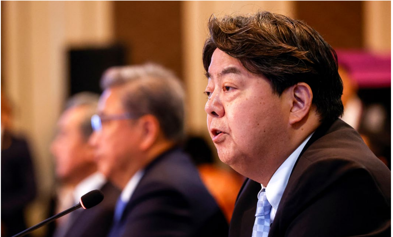
Japan's Foreign Minister Yoshimasa Hayashi speaks at the ASEAN Plus Three Foreign Ministers' Meeting in Jakarta (July 2023).