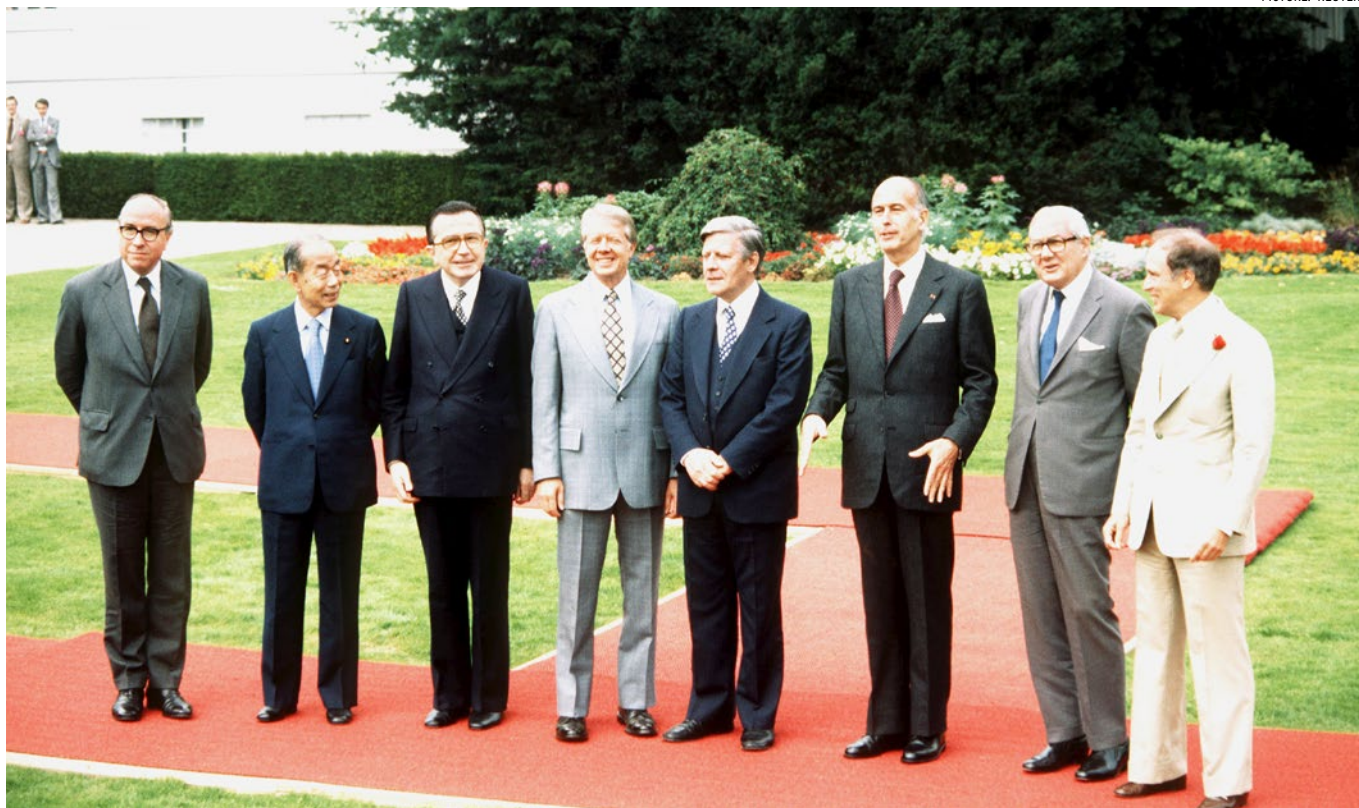
Japanese prime minister Takeo Fukuda pictured with EU commission president Roy Jenkins, Italian president Giulio Andreotti, US president Jimmy Carter, German chancellor Helmut Schmidt, French state president Valery Giscard d'Estaing, British prime minister James Callaghan and Canadian prime minister Pierre Trudeau (16 July 1978).