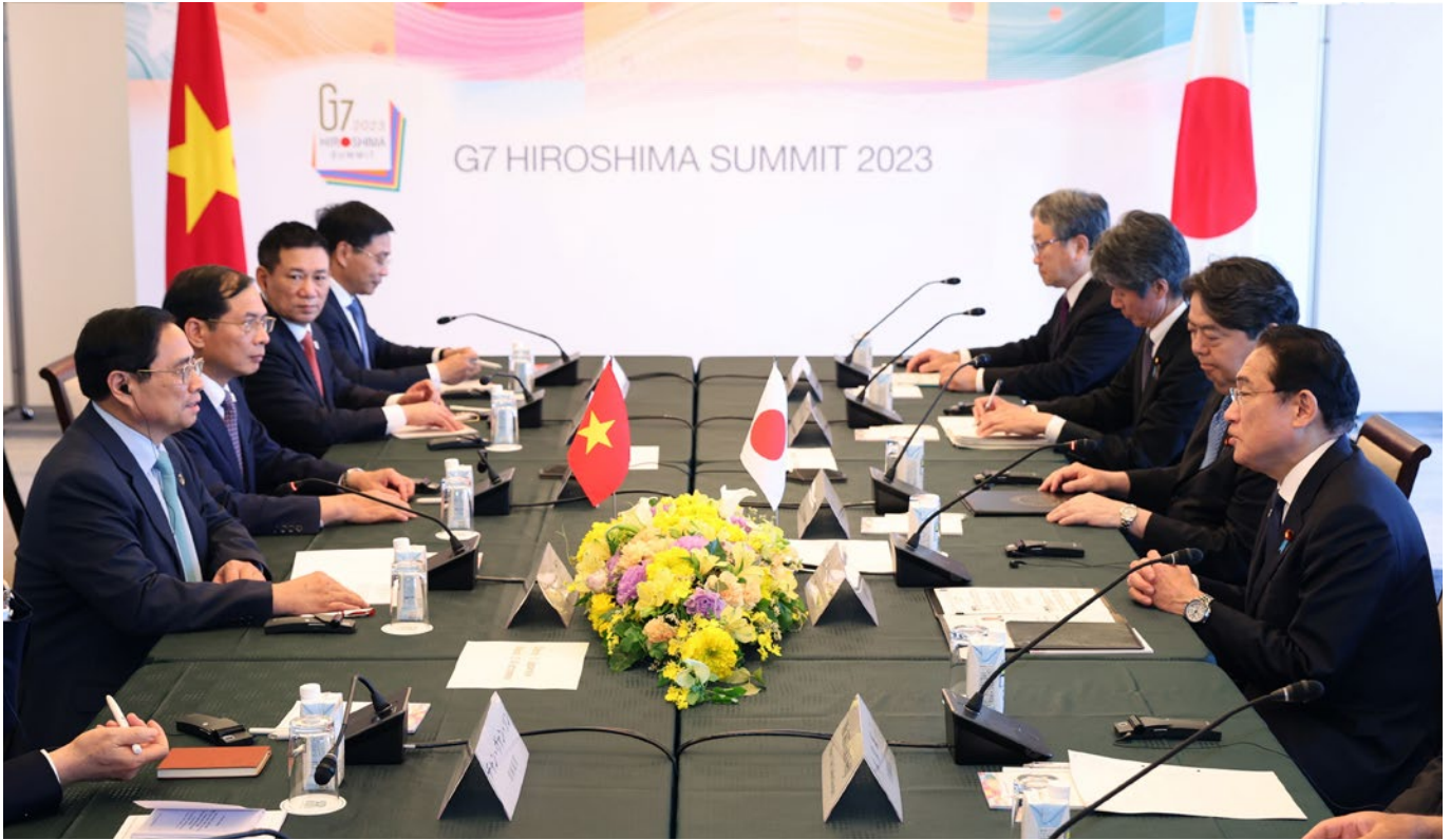
Japanese Prime Minister Fumio Kishida and Vietnam's Prime Minister Pham Minh Chinh meet during the Hiroshima G7 summit (May 2023).