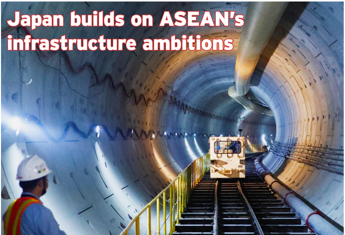
A worker stands in a tunnel of the Jakarta Mass Rapid Transit project funded by the Japan International Cooperation Agency (September 2022).