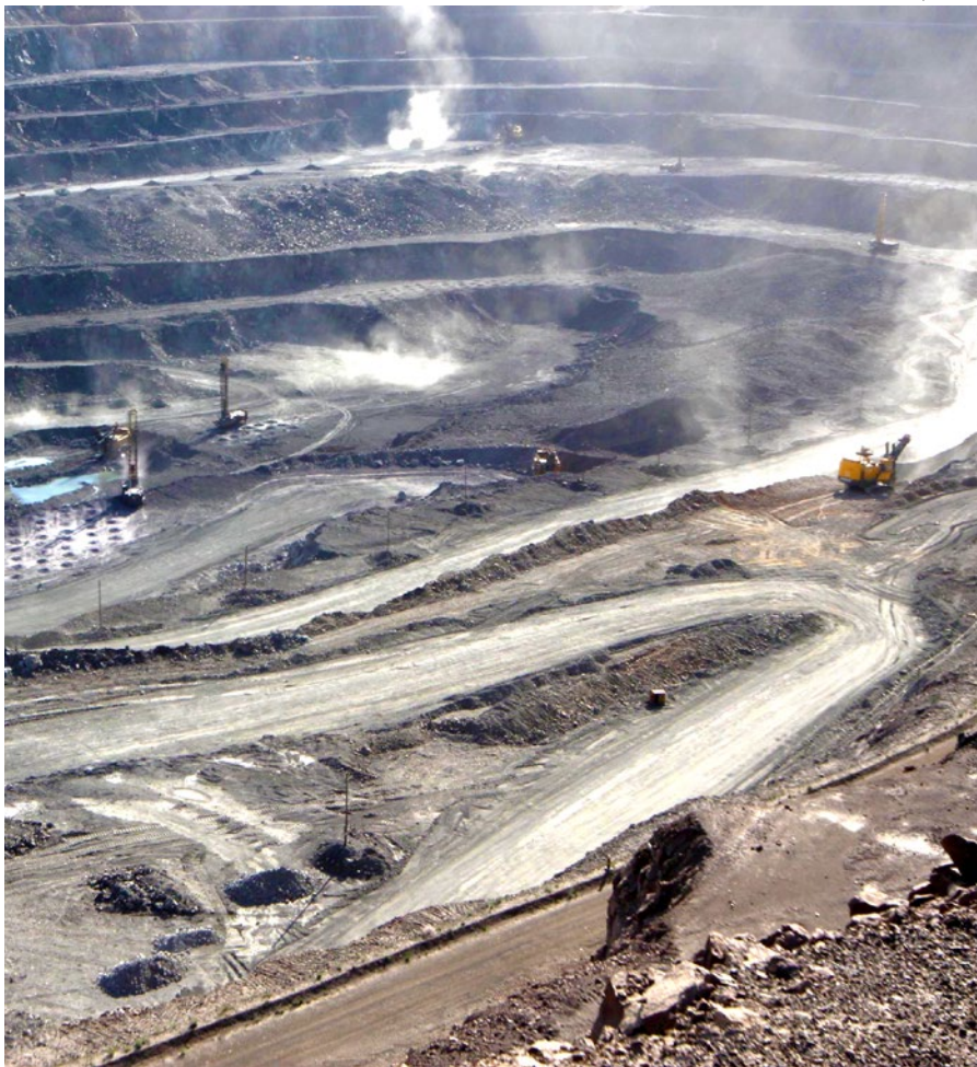
China's Bayan Obo mine in Mongolia, the world's largest rare earth mine, has been operating since 1957.