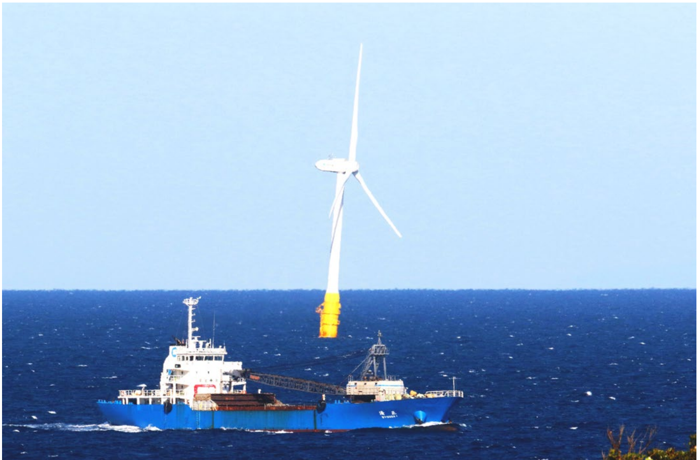
A floating wind turbine is set up by Goto City and Toda Corporation at the Goto Islands in Nagasaki prefecture (October 2020).