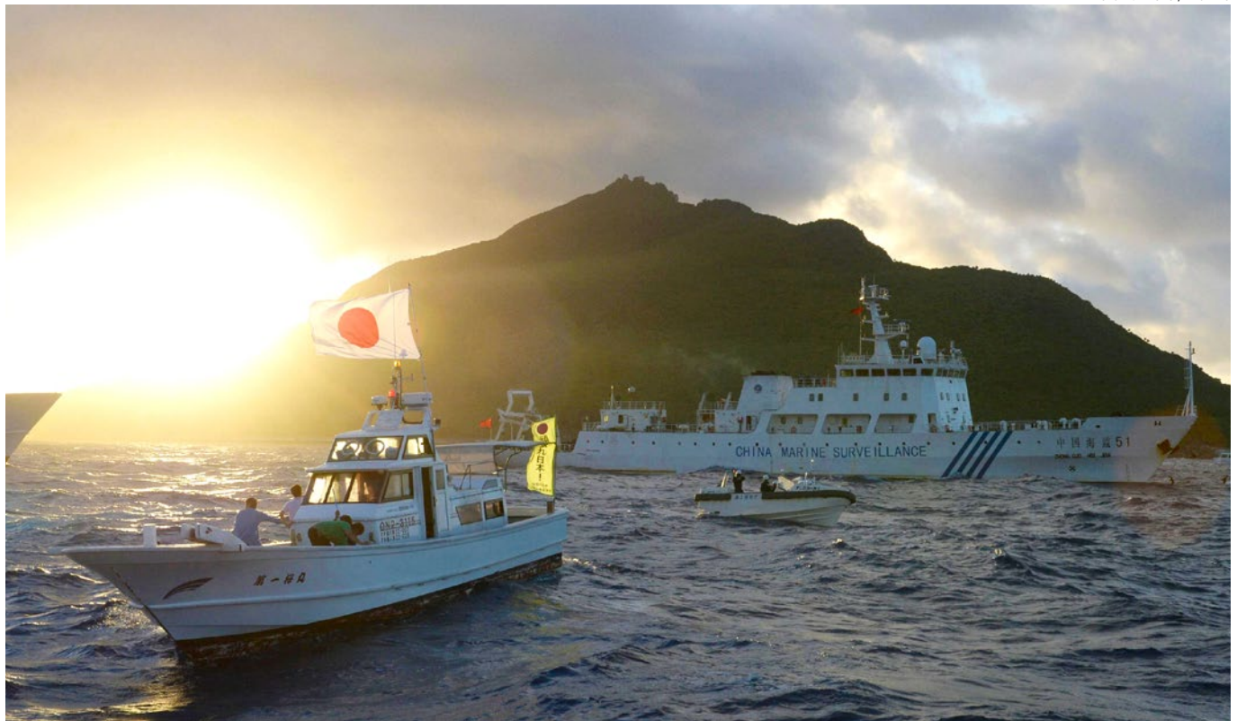
A Chinese surveillance ship sails near Japan Coast Guard vessels and a Japanese fishing boat near one of the disputed Senkaku/Diaoyu islands (July 2013).