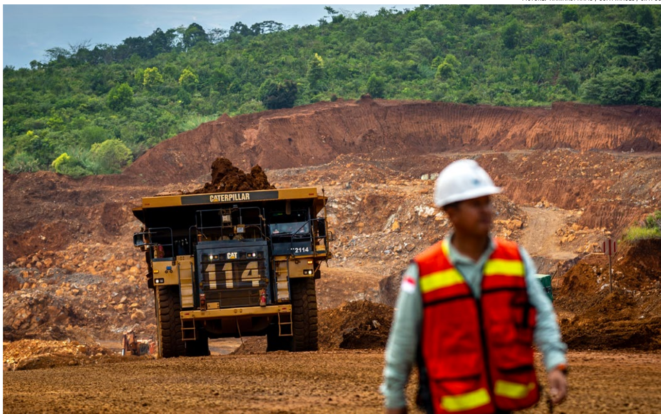
Workers extract nickel at PT Vale's Sorowako mine, one of Indonesia's largest reserves of nickel.