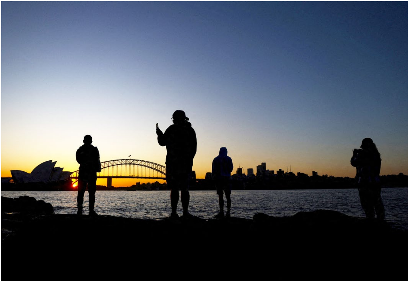
People using their smartphones enjoy a sunset view of the Sydney Opera House and Harbour Bridge ahead of the FIFA Women's World Cup (July, 2023).