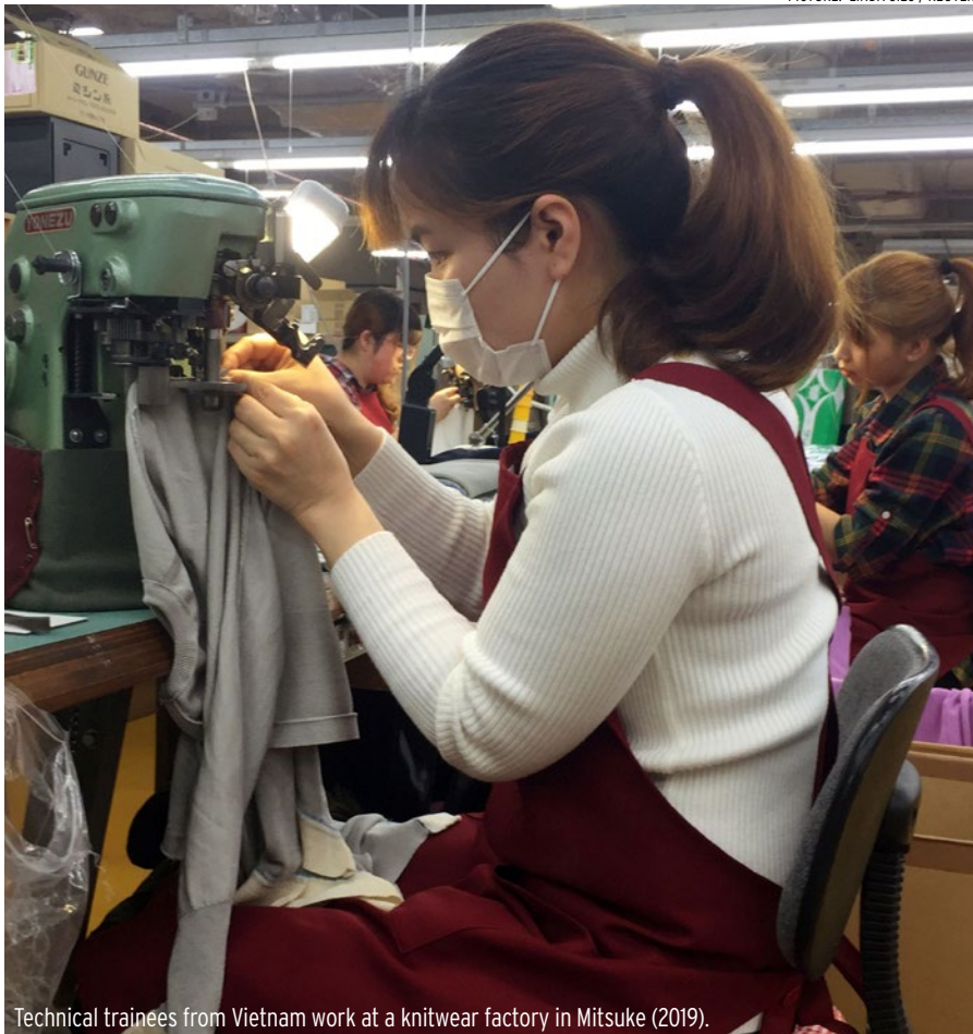
Technical trainees from Vietnam work at a knitwear factory in Mitsuke (2019).