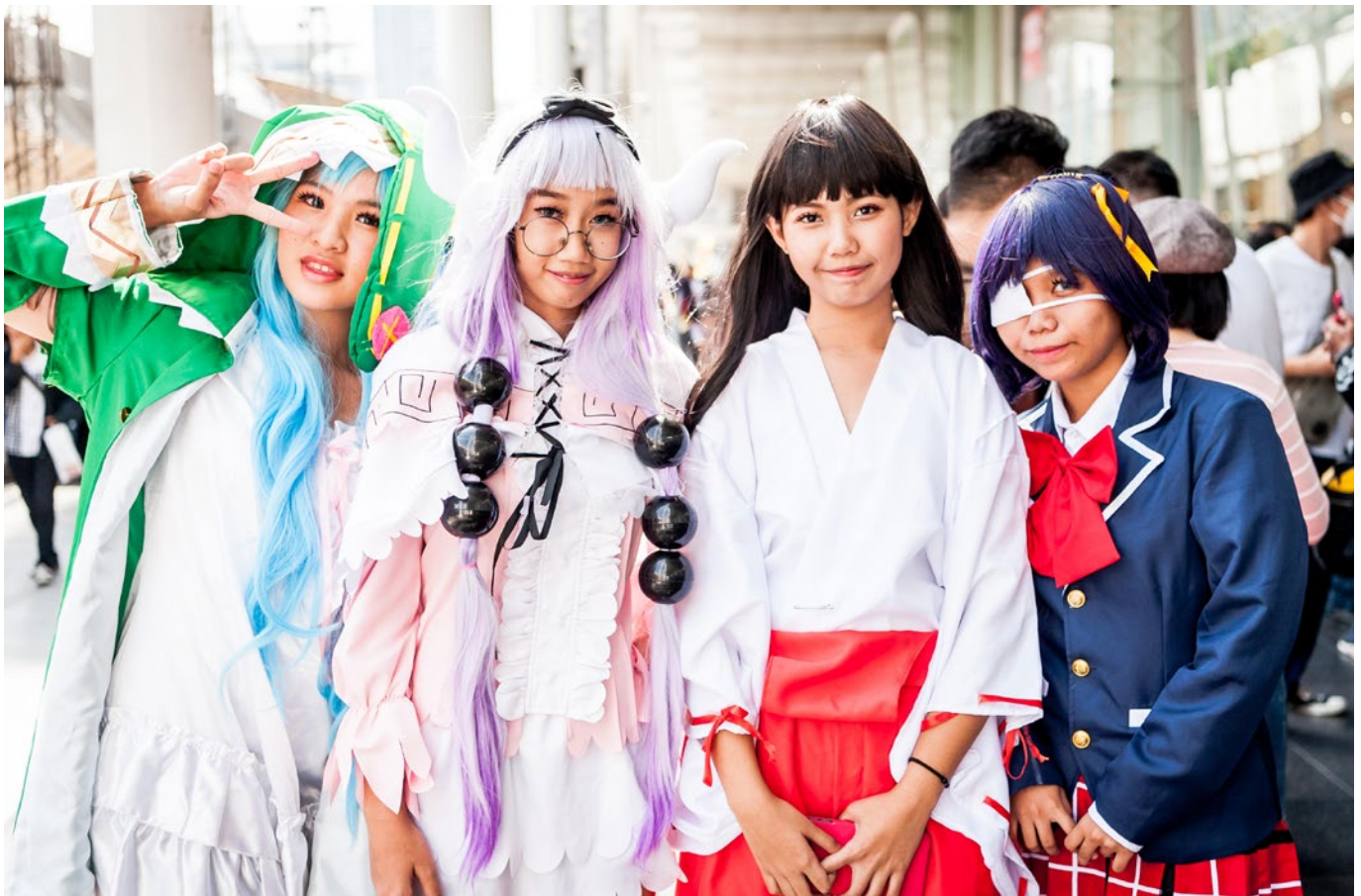
Thai cosplay enthusiasts attend the Japan Expo in Bangkok (2019).