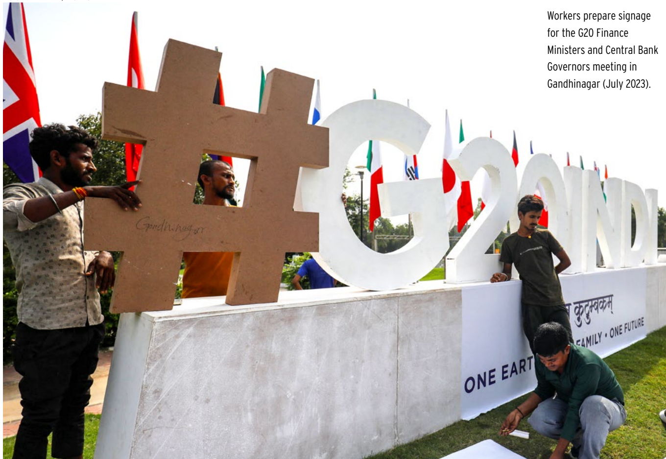
Workers prepare signage for the G20 Finance Ministers and Central Bank Governors meeting in Gandhinagar (July 2023).