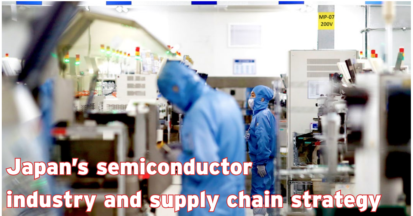
Employees work at a Beijing plant operated by the Japanese semiconductor and microchip manufacturing company Renesas (May 2020).