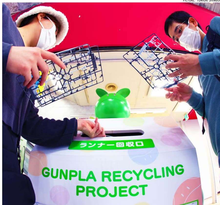
Model makers return plastic scrap to a collection point at a store in Osaka City (November 2022).