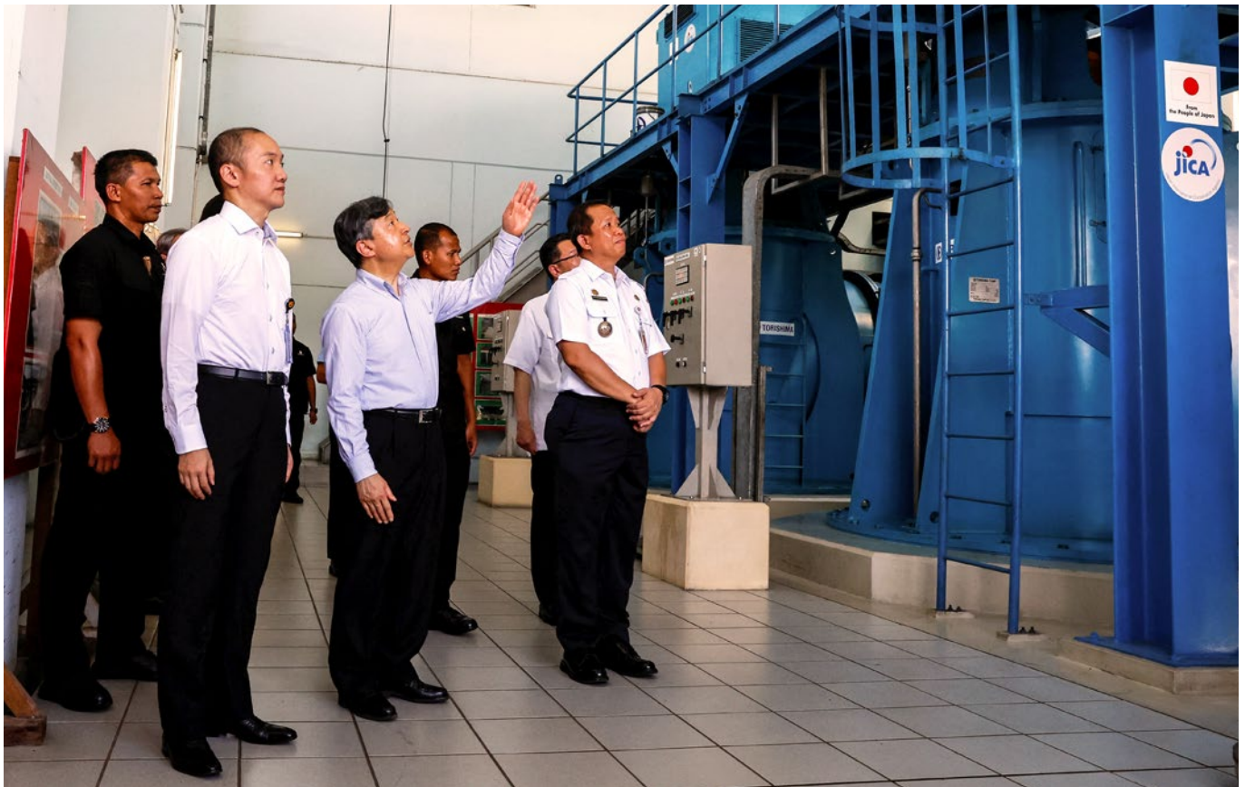
Japan's Emperor Naruhito and an expert from the Japan International Cooperation Agency visit Jakarta's Pluit water pumping facility, which has received Japanese government funding for a critical renovation (June 2023).